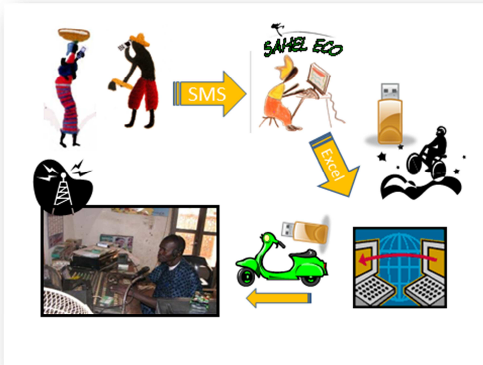
Figure 2: M-Agri Phase 1: key steps and technologies

For the system to work effectively, it was also necessary to: