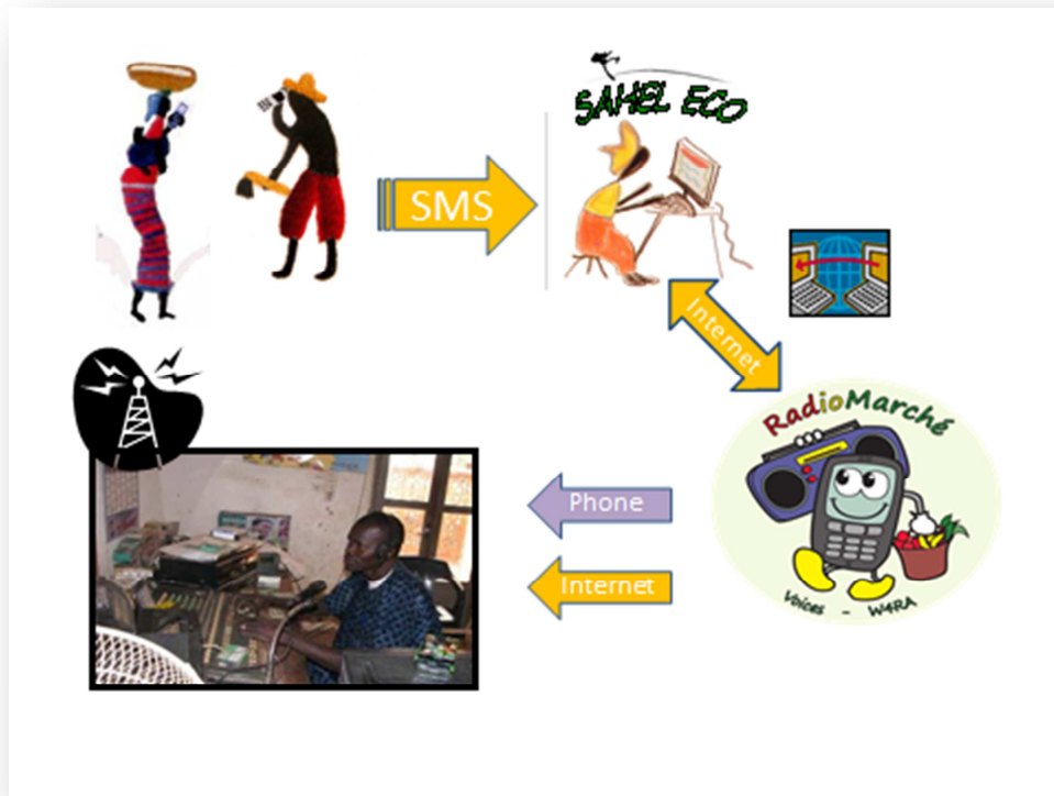
Figure 3: M-Agri Phase 2: key steps and technologies